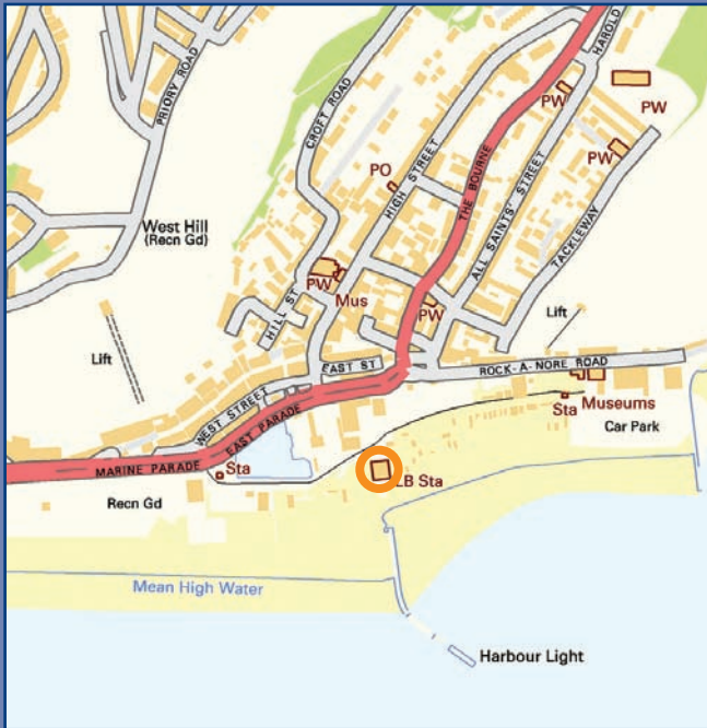
2004 License number 0100031673